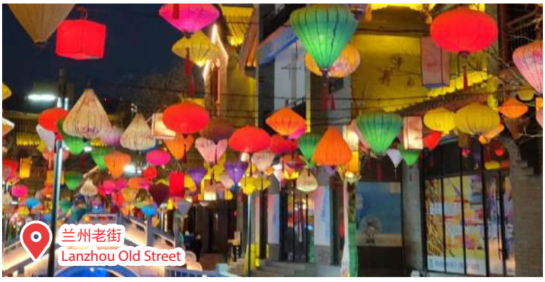
兰州老街 Lanzhou Old Street