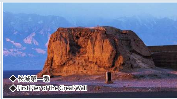
◆ 长城第一墩 ◆ First Pier of the Great Wall