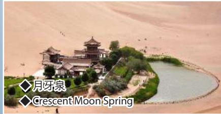
◆ 月牙泉 ◆ Crescent Moon Spring