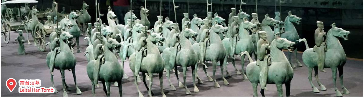
雷台汉墓 Leitai Han Tomb