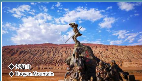
◆ 火焰山 ◆ Huoyan Mountain