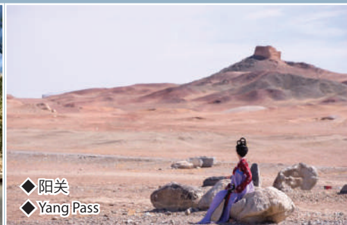
◆ 阳关 ◆ Yang Pass