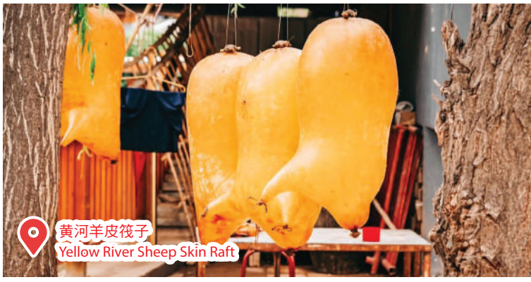
黄河羊皮筏子 Yellow River Sheep Skin Raft