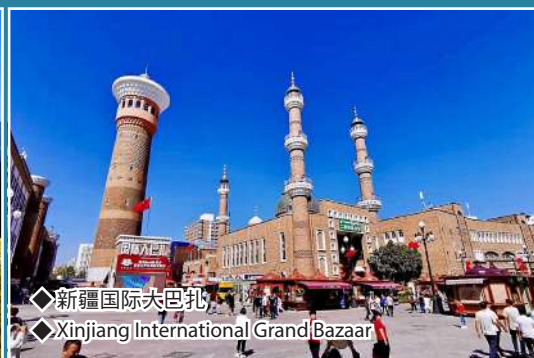
◆ 新疆国际大巴扎 ◆ Xinjiang International Grand Bazaar