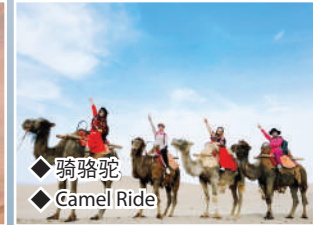
◆ 骑骆驼 ◆ Camel Ride